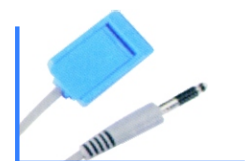
Jack 6,35 Erbe MI 3.05.BLRB.40