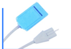
REM Valleylab MI 3.05. VALD.40