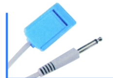
Jack 6,35 standard MI 3.05.BLUE.40